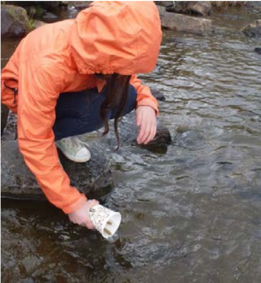
Off you go, little fish!