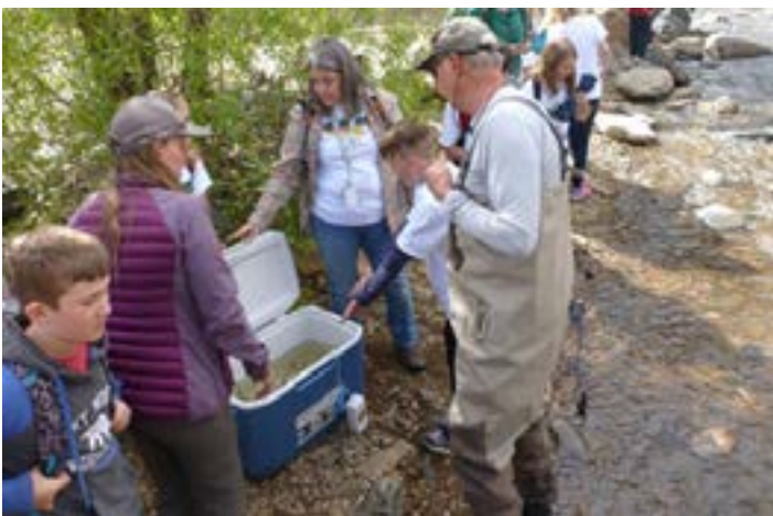
The fish arrived at Mayhem Gulch in a cooler, with a temperature monitor and oxygenator.

Each student had the experience of releasing a fry. Only a few toes got wet!