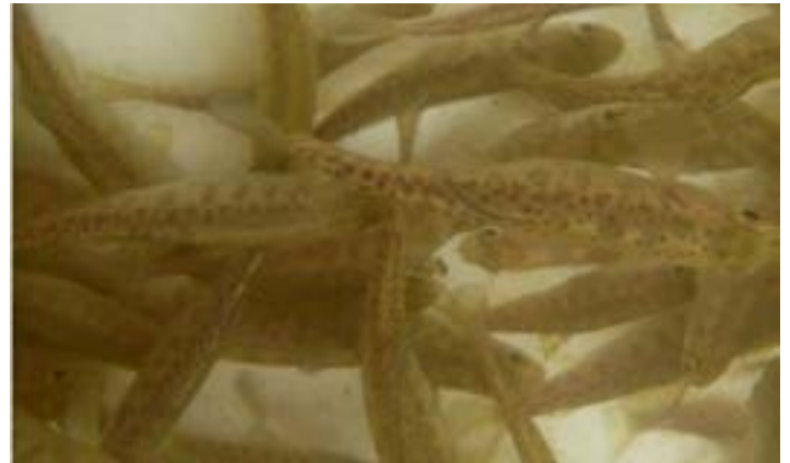
Eight month old trout fry

Each student had the experience of releasing a fry. Only a few toes got wet!